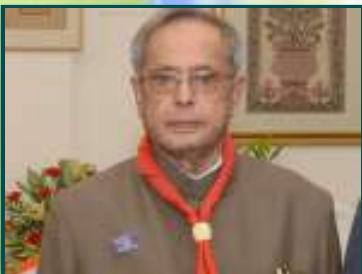
DR. SARVEPALLI RADHAKRISHNAN

A mentor empowers a person to see a possible future